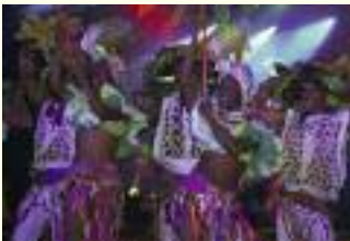
Our last night in Havana

Breakfast on the terrace at the Nacional.