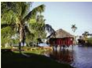
Zapata Peninsula: Our accommodation!