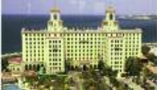
Hotel Nacional - Cuba's most prestigious hotel