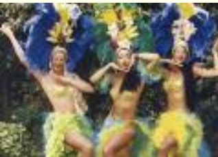
Havana good time!

7.30pm The Cigar Festival Inauguration Dinner. Every year this dinner takes place in a different location with a cigar brand theme and serious entertainment. As yet the Habanos Cigar Festival Itinerary is not finalised so details are not available. All we know at this stage is that it will happen at this sort of price, which will incidentally include all the cigars, cocktails, wine, dinner and quite a nice goody bag, if previous events are anything to go by. ( Estimated supplement of $225.00 ).