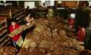
La Corona cigar factory