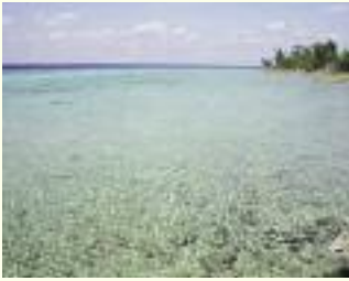
Clear waters in the Bay of Pigs