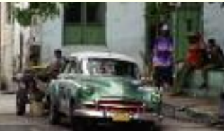
Havana taxi at rest