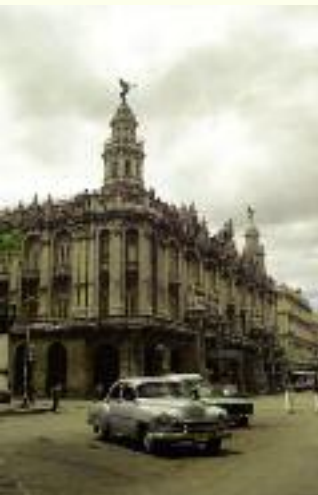
Havana Opera House

Free evening to explore Havana in the good company of The Boisdale Breast Pocket Guide to Havana 2010 .