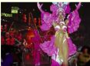
Tropicana Cabaret show Tropicana Club