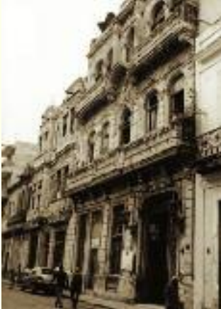
La Guarida entrance

Breakfast on the terrace at the Nacional.